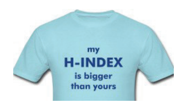
Figure 1: Why there is no progress in understanding superconductivity.

I proposed the H -index hoping it would be an objective measure of scientific achievement. By and large, I think this is believed to be the case. But I have now come to believe that it can also fail spectacularly and have severe unintended negative consequences. I can understand how the sorcerer's apprentice must have felt.